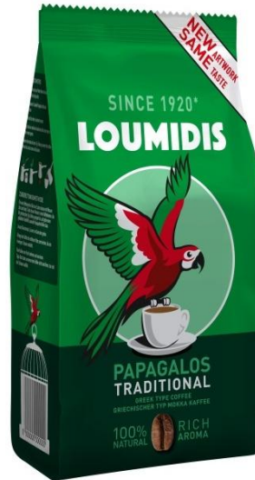
Loumidis Greek Coffee

Nescafe Frappe 12 x 200g Loumidis Greek Coffee 15 x 194g Loumidis Greek Coffee 12 x 490g