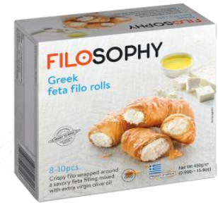
Mini Rolls Feta 450g