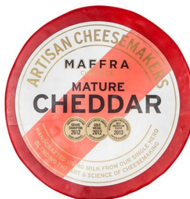
Mature Cheddar Red Wax Wheel 2.4kg