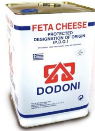
Feta Tin 14kg