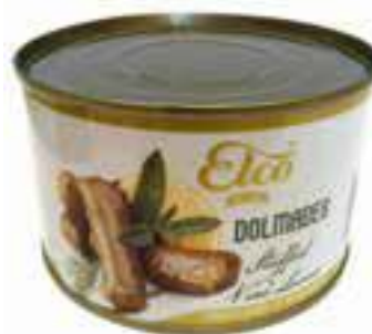
Dolmades Tins 2kg