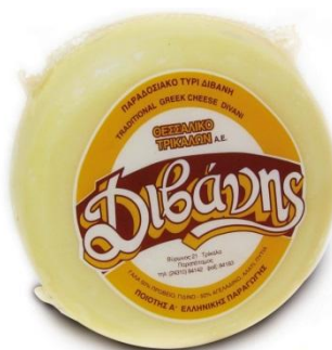
Greek Kasseri 8kg