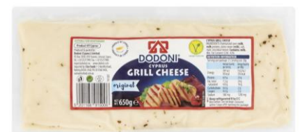
Cypriot Grill Cheese 650g