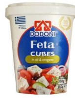
Cubed Marinated Feta 350g