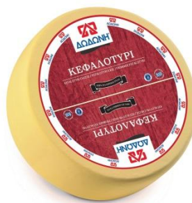
Kefalotyri 9kg r/w