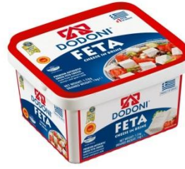
Feta in Brine 1kg