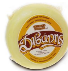
Greek Kasseri 1kg