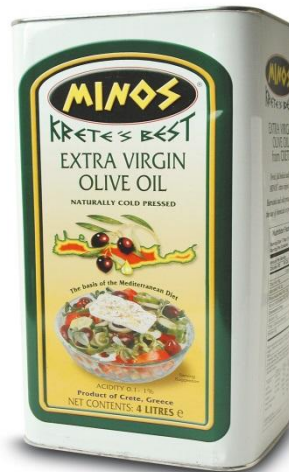
Minos Extra Virgin 4lt

Minos Extra Virgin 3 x 4lt Minos Extra Virgin 12 X 500ml