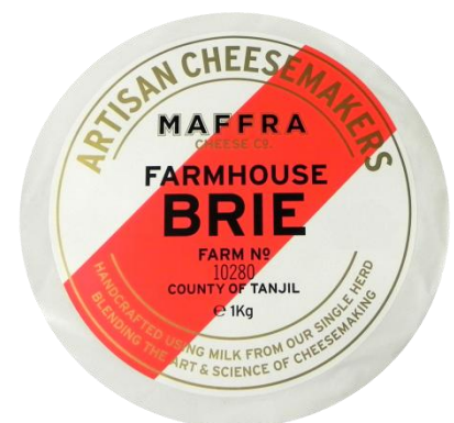
Farmhouse Brie 1kg