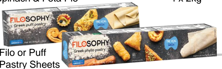
Filo or Puff Pastry Sheets 454g