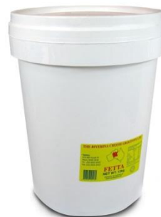
Australian Feta 13kg