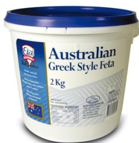
Greek Style Feta 2kg

Divanis Greek Kasseri r/w 3 x 8kg Divanis Greek Kasseri r/w 20 x 1kg Rodopa Kashkaval r/w 12 x 1kg