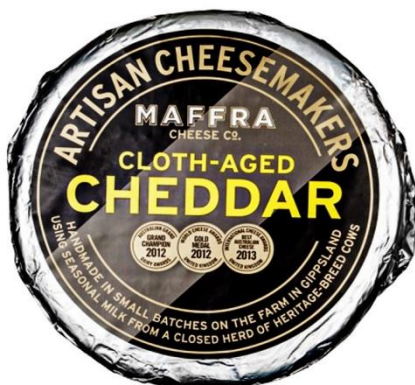
Cloth Wrapped Cheddar Wheel 2kg