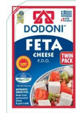
Feta Twin Pack 150g