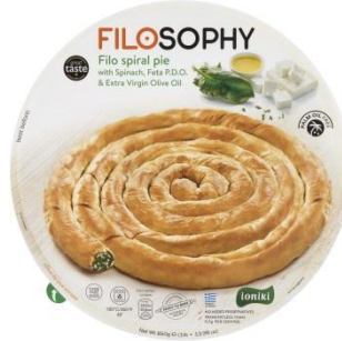
Filo Spirals 850g 3 Variants