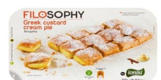
Bougatsa Cream Pie 500g