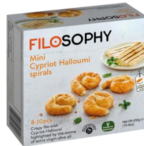
Mini Cypriot Halloumi Spirals 450g