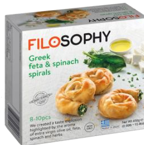
Mini Spiral Feta & Spinach 450g