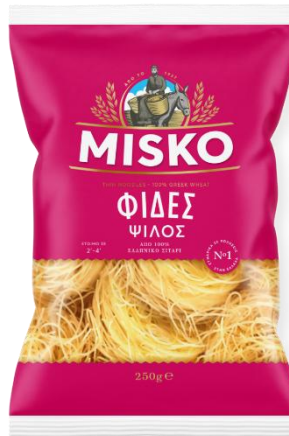
Fine Noodles (fides)#13