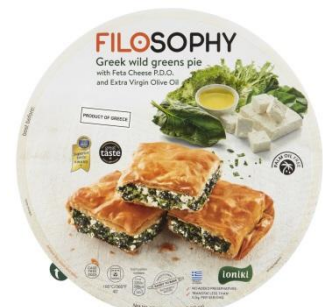
Filo Pie Wild Greens 850g