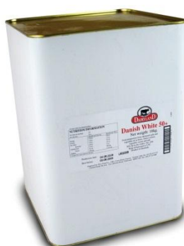
Danish Feta 16kg