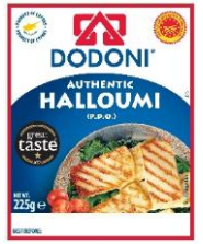
Cypriot Halloumi 225g