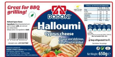
Cypriot Halloumi 650g