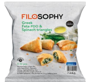
Mini Triangles Feta & Spinach 500g