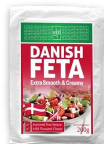
Danish Feta 200g