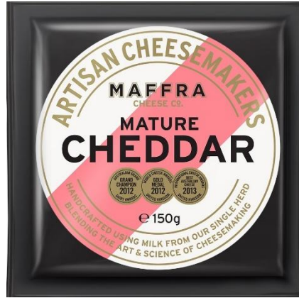
Mature Cheddar 150g

The milk used to make Maffra Cheese is sourced only from the cows on our farm making us a true 'farmhouse' cheese producer. No animal rennet is used in the manufacture of Maffra Cheese, so it is suitable for vegetarians. All cheeses in the range have Halal certification.