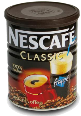
Nescafe Frappe 200g