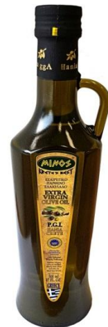
Minos Extra Virgin 500ml