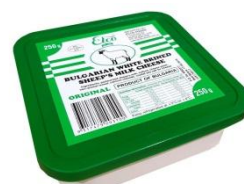
Bulgarian Feta 250g