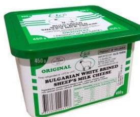
Bulgarian Feta 450g