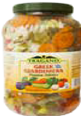
Tragano Greek Giardiniera 500g, 2kg, 3.9kg