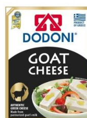
Goat Cheese 200g