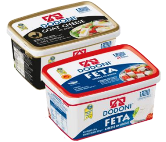
Feta or Goat Cheese in brine 400g