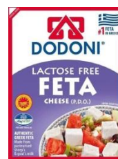
Lactose Free Feta 200g