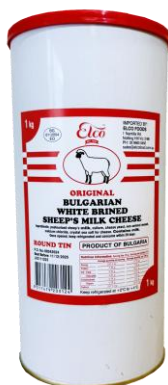
Bulgarian Feta Tub or Tin 1kg