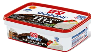
Feta Barrel Aged in Brine 150g