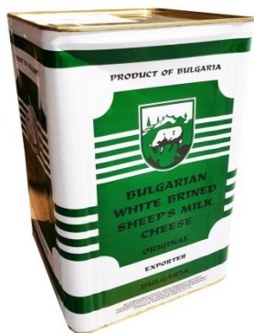
Bulgarian Feta 14kg