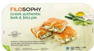
Leek & Feta Pie 550g