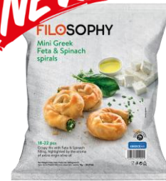
Mini Spiral Feta & Spinach 1kg