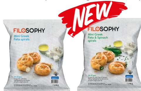
Mini Spirals Feta 1kg