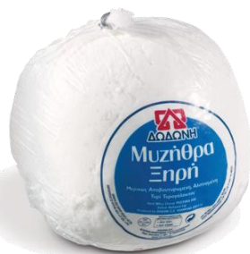
Myzithra 1kg r/w