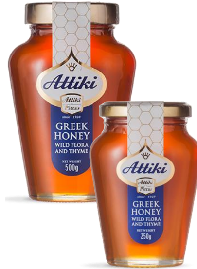
Honey Jar 250g & 500g