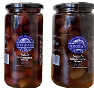
Aegean Bites Olives Plastic Barrel & Glass Jars